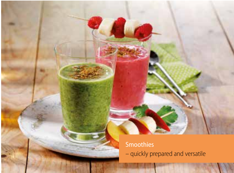
Smoothies – quickly prepared and versatile