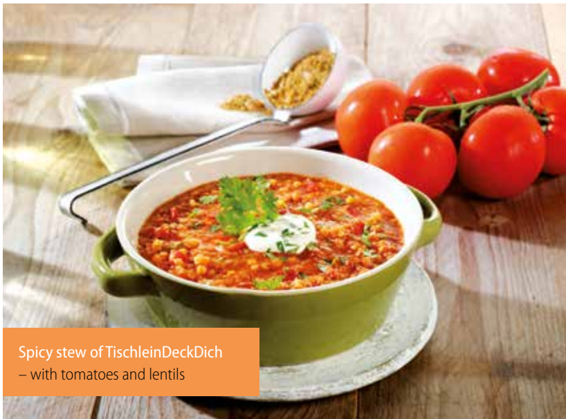
Spicy stew of TischleinDeckDich – with tomatoes and lentils